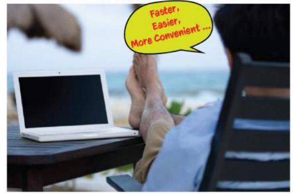
Through our new online signup and secure payment page

Renew or Sign Up For Your HEAR Membership Now!